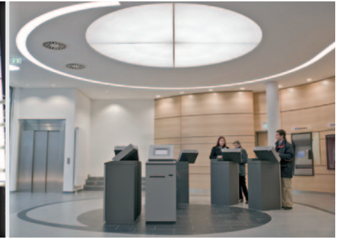
Linear and area lighting