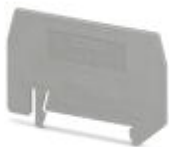
Partition plate, Length: 61 mm, Width: 2 mm, Height: 42 mm, Color: gray

DIN rail perforated - NS 35/ 7,5 PERF 2000MM - 0801733