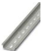
DIN rail, material: steel galvanized and passivated with a thick layer, perforated, height 7.5 mm, width 35 mm, length: 2000 mm

DIN rail perforated - NS 35/ 7,5 PERF 2000MM - 0801733